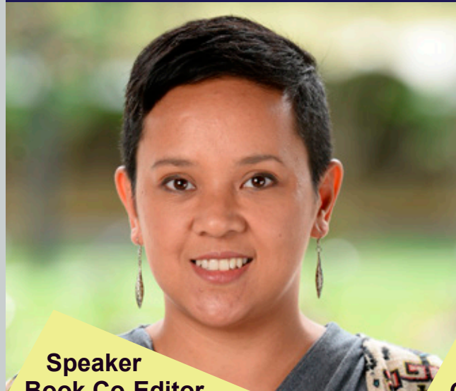
Speaker Book Co-Editor