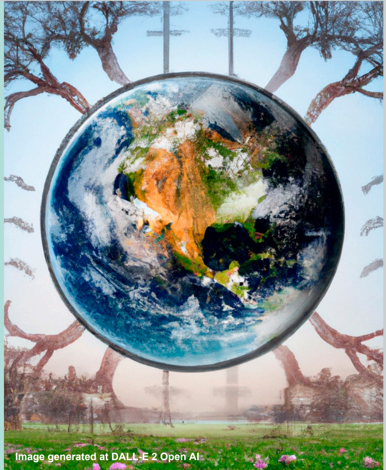
Image generated at DALL-E 2 Open AI